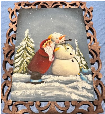
Lift Up a Friend